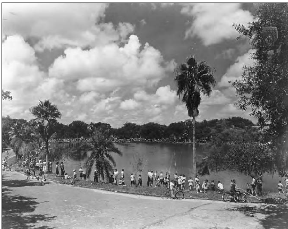
The 1948 Fish-A-Thon as memorialized in the median marker.