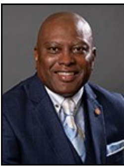
The Honorable Orlando Gudes City Council District 5

Sincerely, Guido Maniscalco, Tampa City Council- District 6