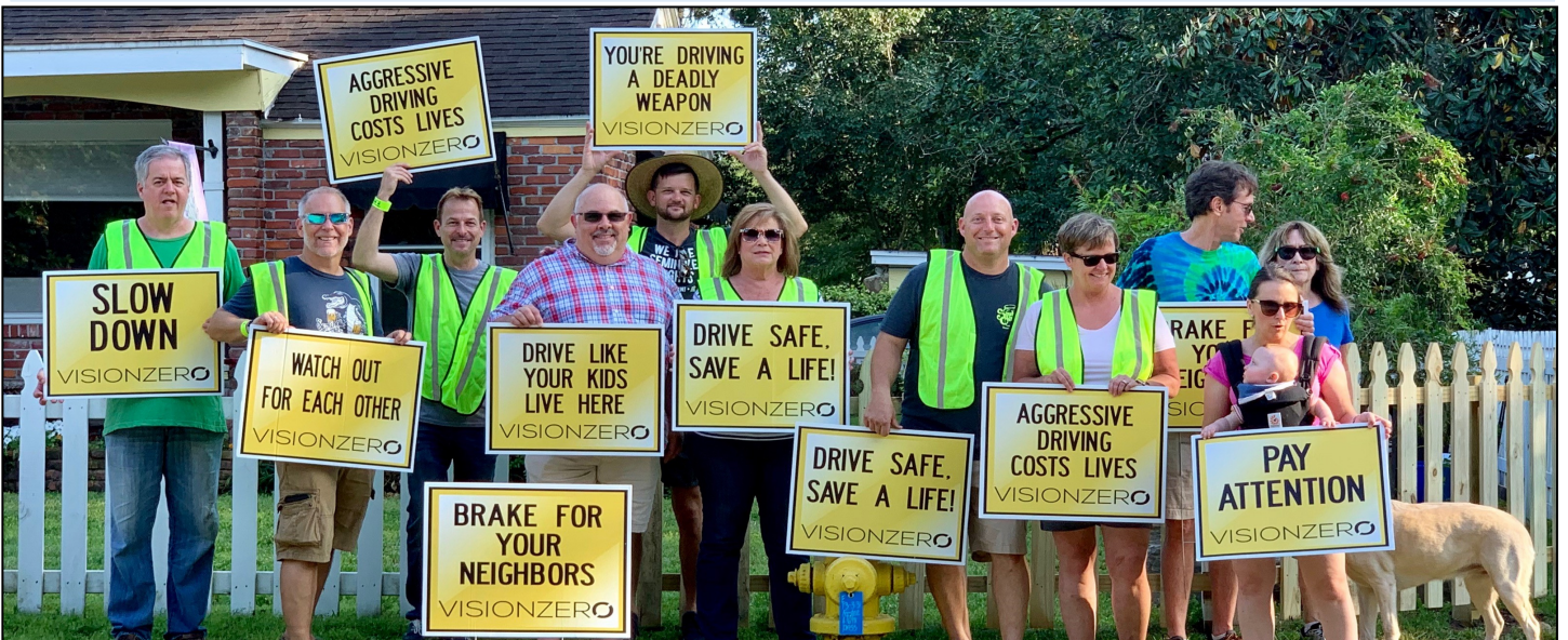
Neighbors, pups and kids gather to warn motorists to SLOW DOWN!

To learn more about Vision Zero you can go www.planhillsborough.org/vision-zero/